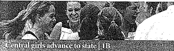
Central girls advance to state | 1B

More than a century of covering our community | Get updates at forsythnews.com | 50¢